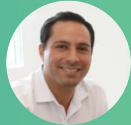
Mauricio Vila Dosal