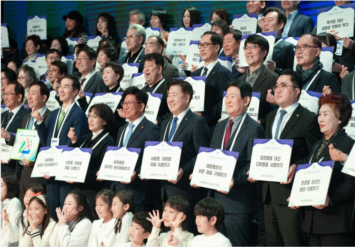
Citizens Committee for 2040 Plastic Zero Jeju a Launching Ceremony (Feb 24,2023)