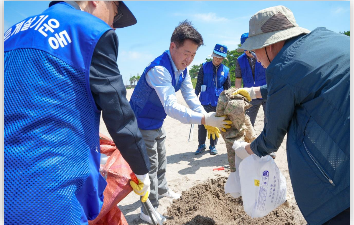
Flogging Campaign at Iho Tewoo Beach (Aug 7, 2023)